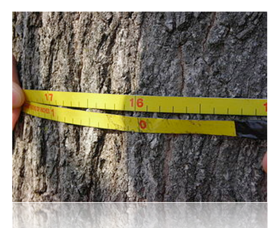
DBH -Diameter at Breast Height