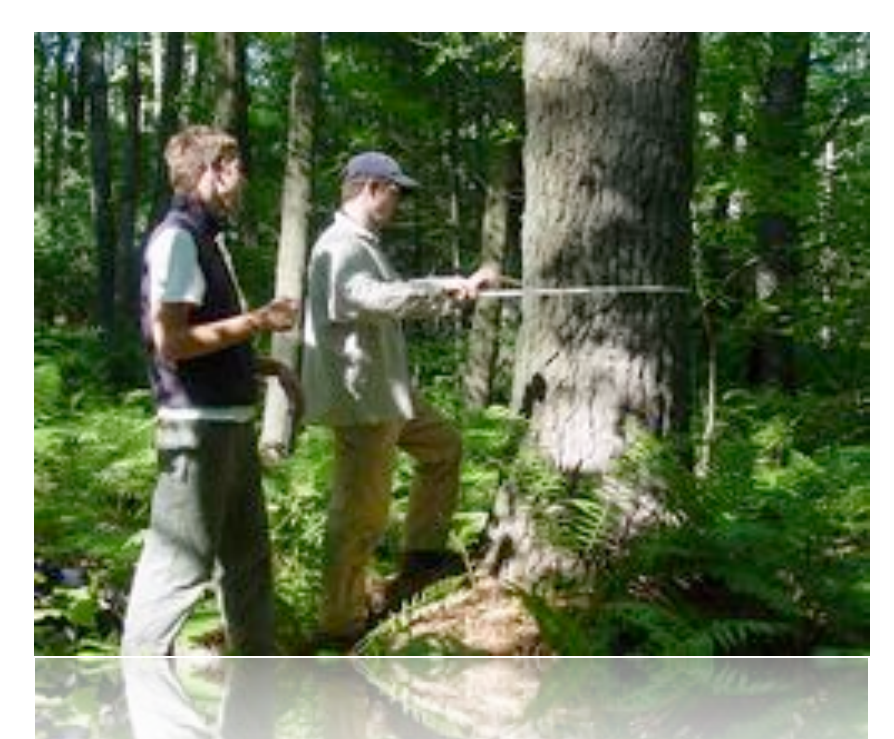
DBH -Diameter at Breast Height